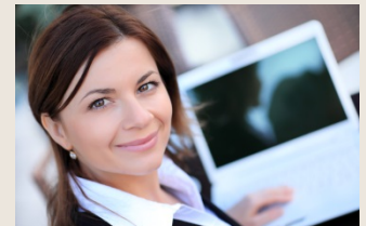
Annual Resident Satisfaction Survey Goes On Line! Please be sure we have your email address. We don't want to miss a single comment or suggestion.

Also this year, there are some VERY nice participation prizes. More to come! Stay tuned!