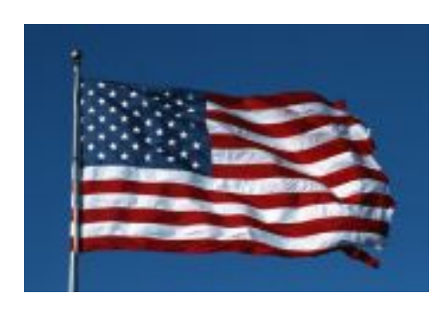
There are six United States flags on the moon

What can one do to avoid disrespecting the flag? The flag should never be dipped to any person or thing. It should not be displayed with the union (stars) down, except as a signal of dire distress. The flag should never touch anything beneath it, including the ground. The U.S. Flag Code also states, "The flag should never be used as wearing apparel, bedding or drapery."