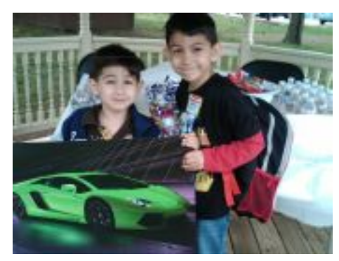
National Babe Ruth Day Event

School's out for the summer so stay cool with a Popsicle! We're celebrating your last day of school (6/19) so swing by the Neighborhood Center after you're released to receive your ice cold treat! While supplies last.